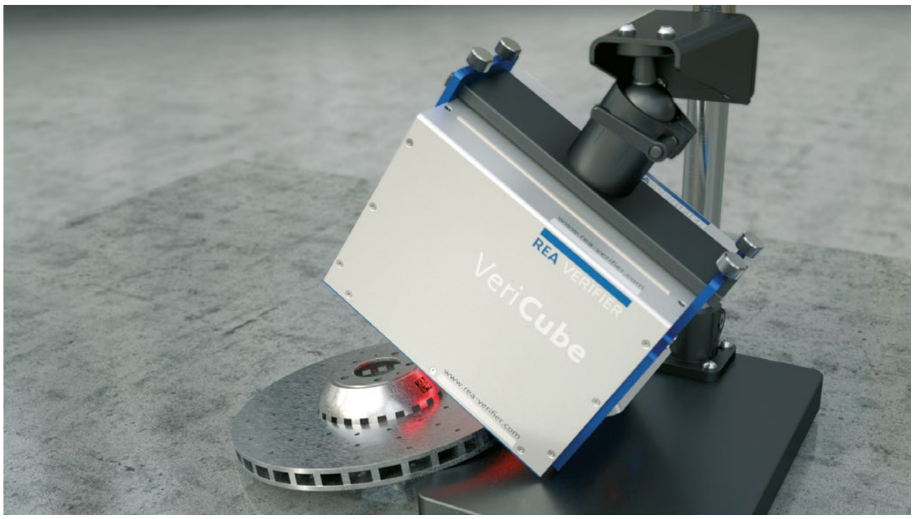
Stand solution for code verification on 3D objects