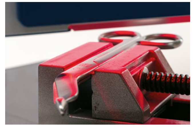
Verification of surgical instruments